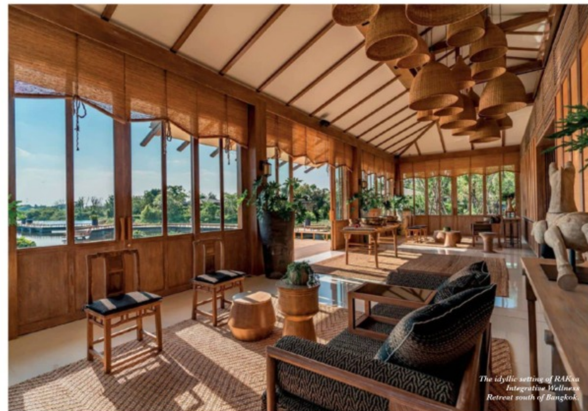
The idyllic setting of RAKxa Integrative Wellness Retreat south of Bangkok.

more popular with our female guests, our male guests are more interested in trying targeted solutions such as cryotherapy, acupuncture and personal training," offers Bien. RAKxa Integrative Wellness has a roughly 50 to 50 female-male guest ratio; for Anantara Riverside Bangkok Resort, it's 60 to 40. McGroarty believes that this interest stems in part from the extensive media