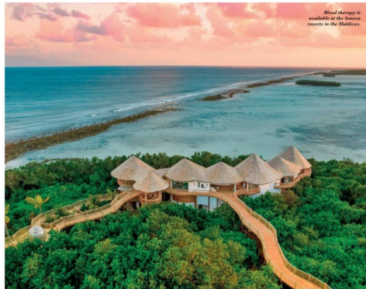
Blood therapy is available at the Soneva resorts in the Maldives.

P icture this: You're ensconced in a luxurious resort in a dreamy locale. As you step out of your private villa and saunter towards the spa, you're greeted not only by spa therapists, but also a team of medical professionals. They're there to welcome you on a multi-day programme that will address your physical, mental, emotional and spiritual wellness.