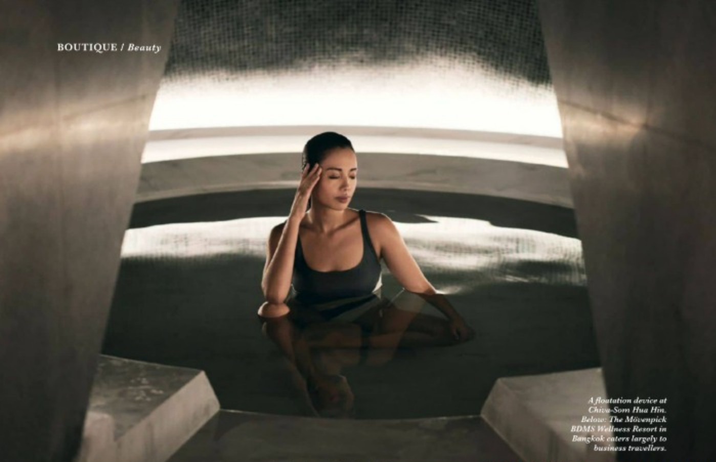
A floatation device at Chiva-Som Hua Hin. Below: The Mövenpick BDMS Wellness Resort in Bangkok caters largely to business travellers.