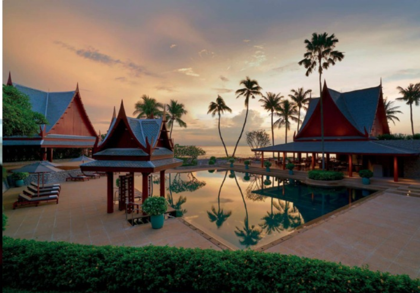
BDMS Wellness Clinic Retreat at Anantara Riverside Bangkok. Above: The beachside location of Chiva-Som Hua Hin adds to the appeal of the resort.

The latest addition to Kuala Lumpur's Sunway