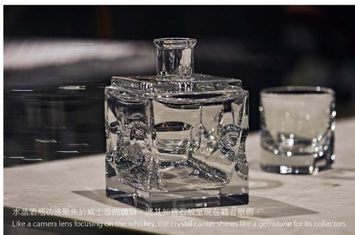
水晶酒瓶彷彿聚焦於威士忌的鏡頭，將其如寶石般呈現在藏家眼前。 Like a camera lens focusing on the whisky, the crystal canter shines like a gemstone for its collectors.

Like a lens focusing on the whisky, the crystal decanter shines like a gemstone for its collectors. In the moment of lifting the wooden case, the reflection of light resembles the way the sun shines through the oak wood trees. Unbottling the decanter becomes a process of enjoyment, a ritual marking the magical moment of opening a precious jewelry box.