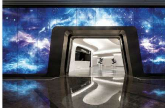
上: 平安金融中心 下: 深圳湾一号的一个公寓主卧房