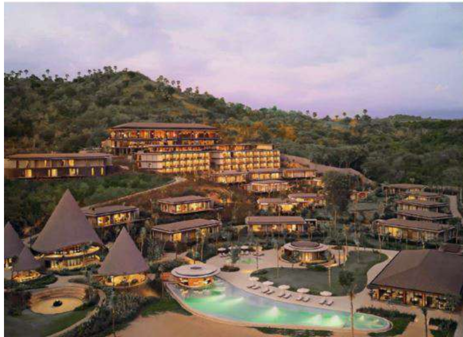
Overlooking the Flores Sea, Ta'aktana resort comprises 70 suites and villas.