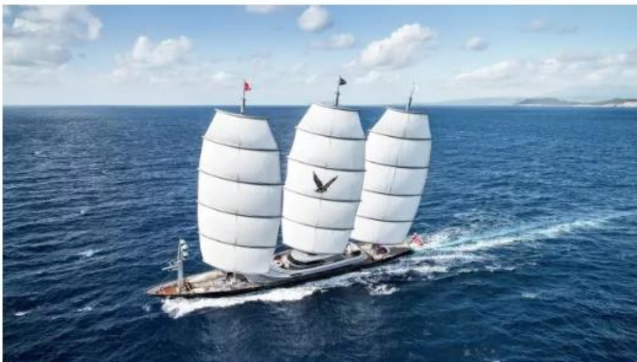
S.Y Maltese Falcon 号