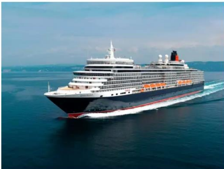
尊贵游轮——伊丽莎白女王2号 (QE2) Queen of the Sea - Elizabeth II Cruise Liner