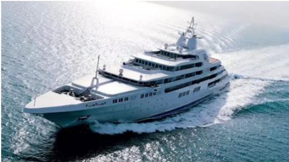
奢华游艇 M.Y Dubai