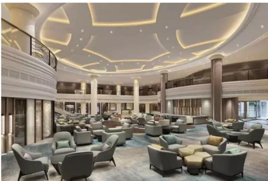
万豪虹桥大酒店 JW Marriott in Hongqiao